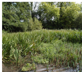
Shallow water habitat created by high sedimentation rates and lowered water levels.

Current hydrological conditions accompanied by high water quality has led to the development of species-rich marginal shallow water habitat. The presence of unusually high flow 'channels' within the ponds has enhanced the biodiversity of these waterbodies.