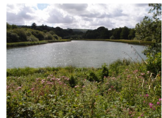
Views over open water

Late successional stage ponds support a varied fauna and can add to diversity at the landscape level. Nevertheless views over open water are important for amenity reasons.